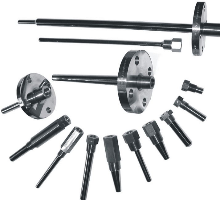
A selection of fabricated and solid-drilled thermowells