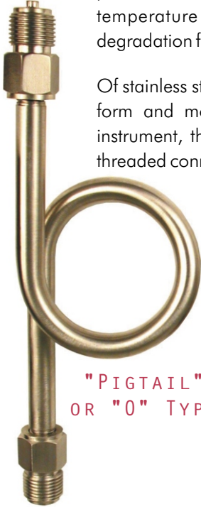
"PIGTAIL" OR "O" TYPE